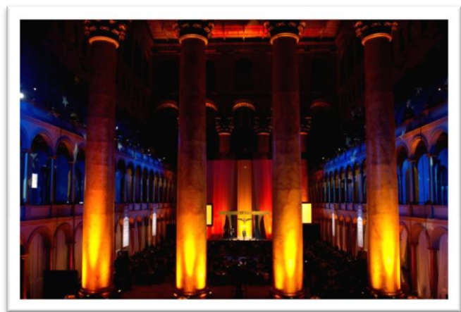
Centennial of Naval Aviation Commemorative Gala, National Building Museum