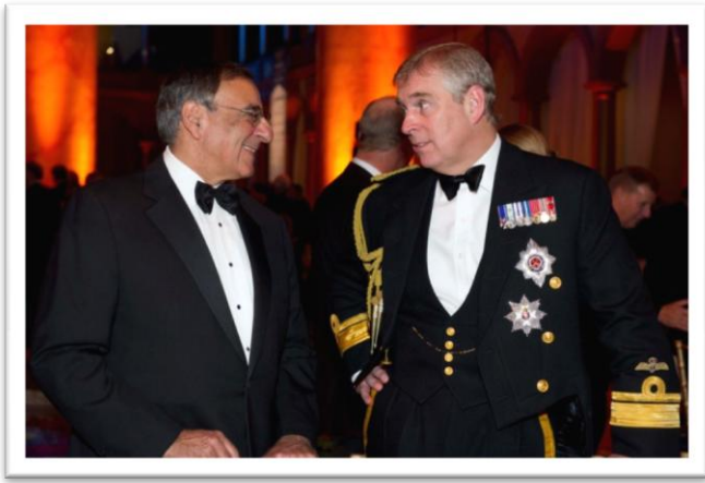
Secretary of Defense Leon E. Panetta speaks with Prince Andrew, the Duke of York